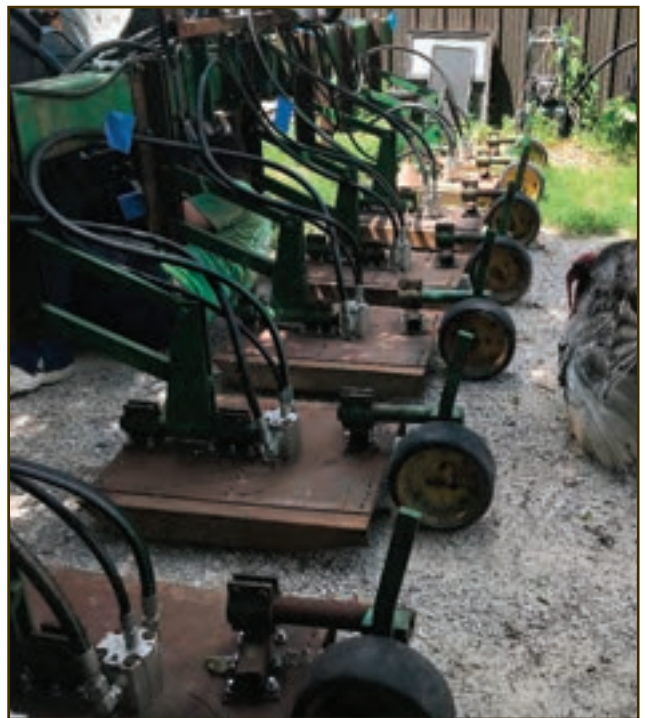
Figures 2-3. Mowers in production at the University of Missouri that were converted from old cultivators through collaboration with a stakeholder who received a SARE farmer-rancher grant.