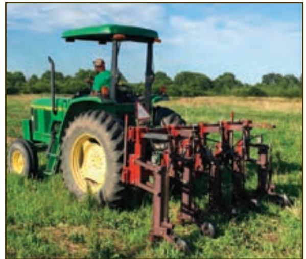
Figure 1. Photo of between row mower designed and built at the University of Missouri.

Concerns about weed control without the use of herbicides has limited the adoption of organic agriculture in the United States and farmers who have adopted organic practices list weed control as one of their greatest problems . The reliance of non-organic farmers on a limited number of herbicides has contributed to the weed problem by selecting for exploding populations of glyphosate-, imazethapyr-, and thifensulfuron-resistant weeds . Resistant Palmer amaranth was found to have an economic impact of $17.5 million in just one county in Georgia and over $100 million was spent on its control by cotton farmers in Georgia in 2010 and 2011 . Because water hemp and Palmer amaranth control is often poor in non-organic fields, their prevalence has contributed to widespread dispersal of seeds and contamination of neighboring organic fields. Both weeds have aggressive growth habit and prolific seed production. Under Missouri growing conditions, water hemp and Palmer amaranth plants produce an average of 289,000 and 251,000 seeds per plant per year .